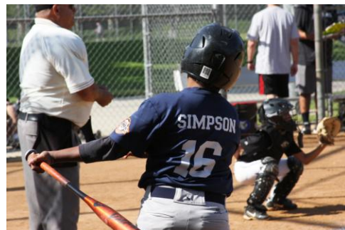
Frontier Youth Baseball League in Cerritos .