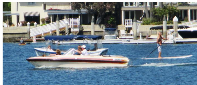
Traffic on Alamos Bay in the Belmont Shore area of Long Beach : kayak, Duffy, pleasure boat & paddle board.