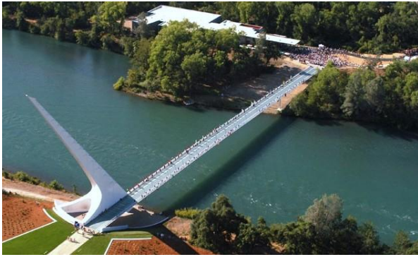
$23 million Sundial pedestrian bridge over the Sacramento River. The 700 foot long bridge works as a functioning sundial.