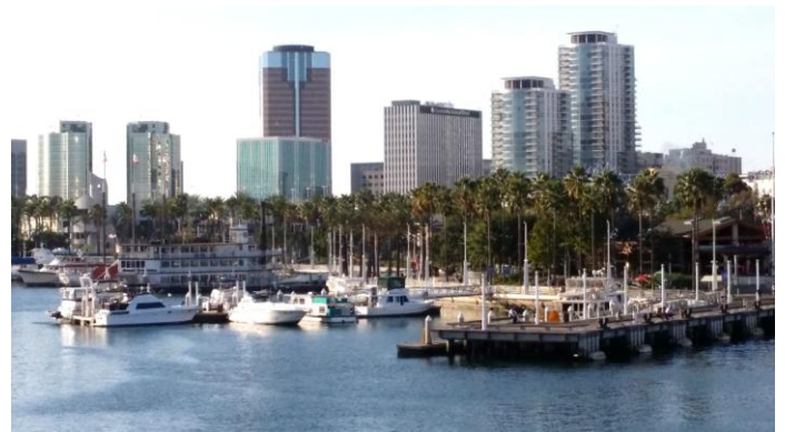
A magnificent view of downtown Long Beach .