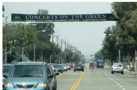
City of Cypress