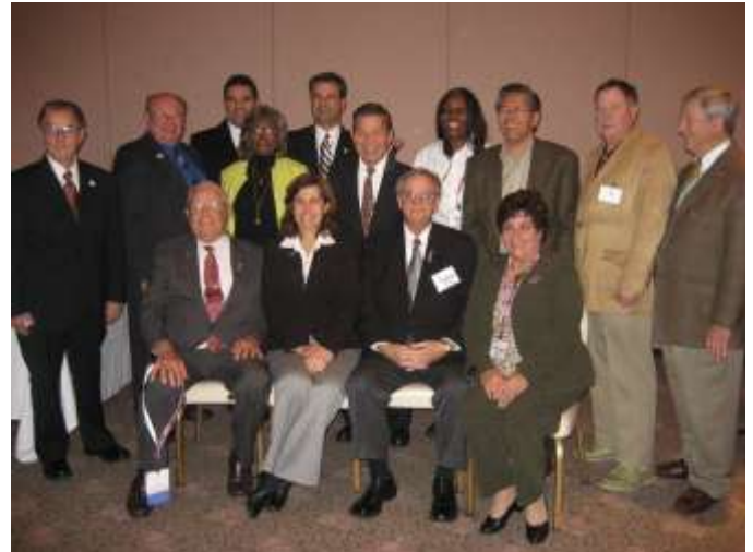
The CCCA and ICA leadership at the January 2008 Legislative Orientation organized by the two groups.