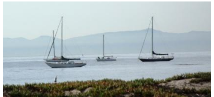
Sailboats ride easily at anchor near the Santa Barbara Pier with Santa Cruz Island 25-miles off the coast. Santa Cruz is the largest of California's eight Channel Islands.

California's city managers in order to include a broad sampling of those who practice in the city management community. We realize that the stories we tell are abbreviated and largely aimed at professional comings and goings. We can only write our stories with the information at hand, though we try to expand with broader and personal information when we can. We hope you find value in our efforts.