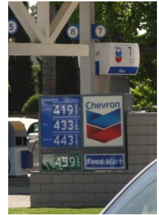
Signs of the time: April, 2011