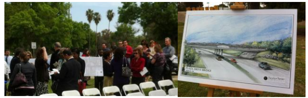
Plaza Drive Bridge Groundbreaking in Visalia