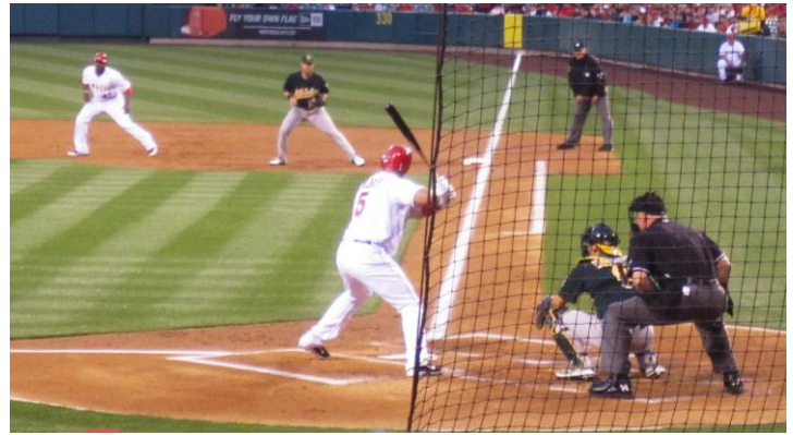
First Baseman Albert Pujols at the plate in an L.A. Angels of Anaheim game against the Oakland "A's". Angel pitcher Jered Weaver achieved his 1,000th strikeout in the game that the Angels won 6-0.