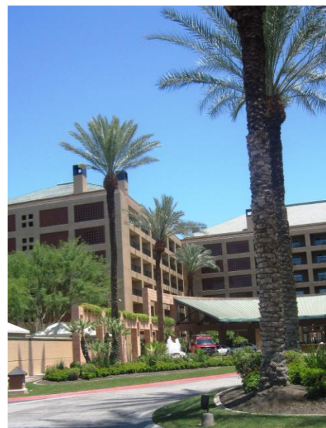
Renaissance Esmeralda, Indian Wells, California