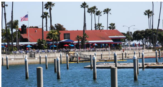
Boat slip improvement project underway in Long Beach .