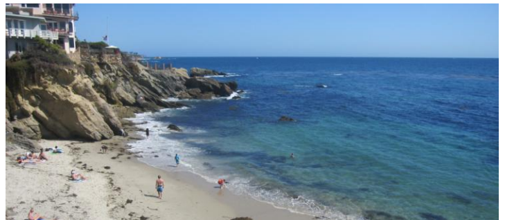
Woods Cove at Laguna Beach , California

"The only way to have a friend is to be one."