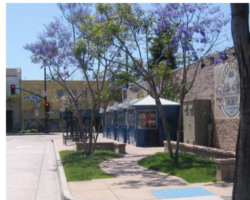
Belmont Avenue, Bellflower , California.