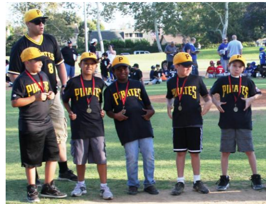
AA Pirates of the Frontier Youth Baseball League, a Cal Ripken League, in Cerritos . The boys are doing their Aaron Rodgers belt move after receiving their first place medals.