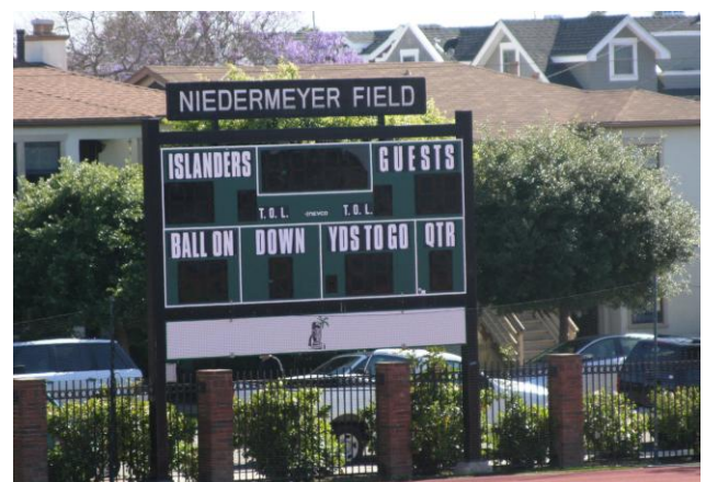
Niedermeyer Field at Coronado High School