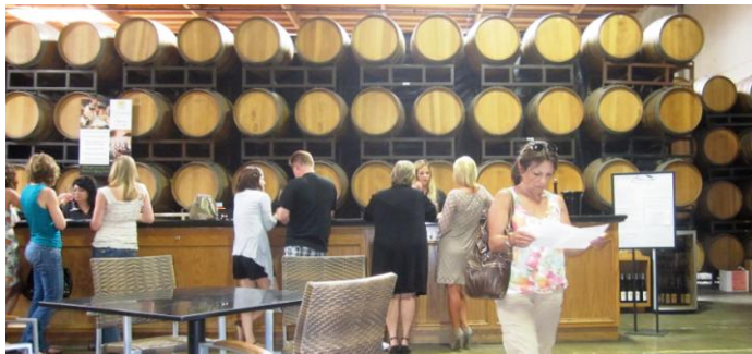
Tasting: a favorite California "year-round" activity!