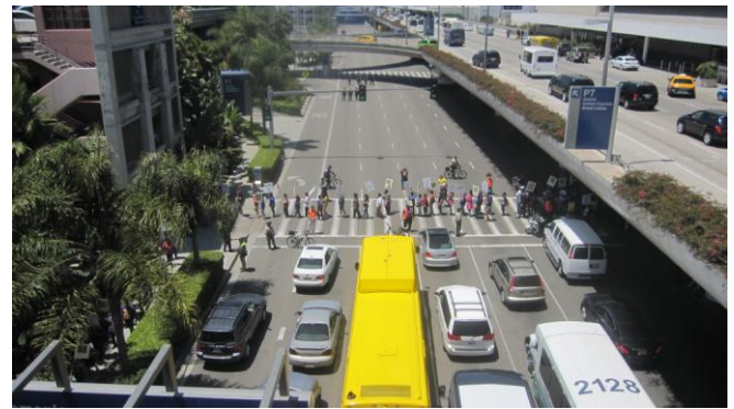
Pickers shut down traffic lanes at LAX