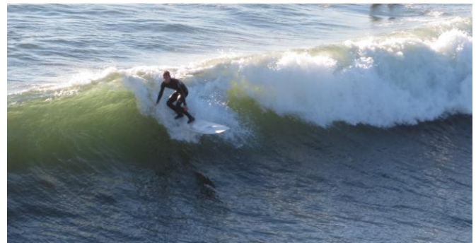
Surfing the north side of the Huntington Beach Pier.