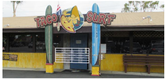
One of the favored luncheon spots in Orange County's City of Los Alamitos .