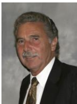
Cerritos City Manager