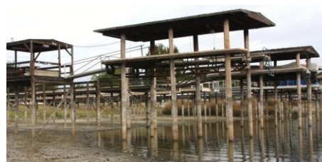
Drought conditions in Lake County, October, 2014.