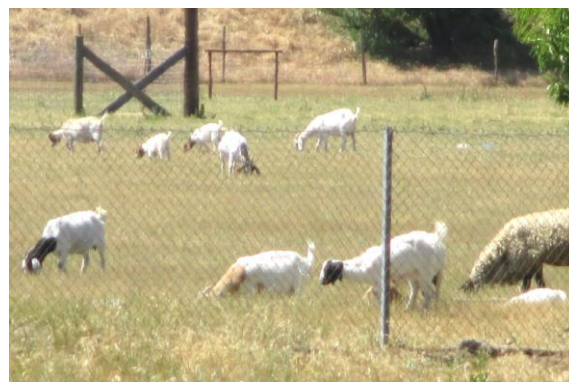
Grazing goats in Turlock