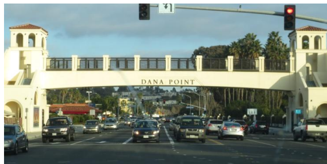
Dana Point , California