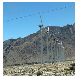
Wind generation of electric power in the Coachella Valley