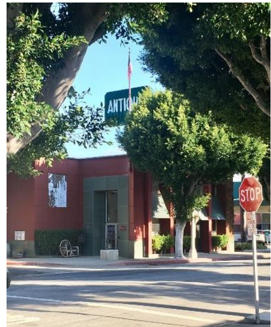
Built as a Bank of America branch, it is now an antique store on Viking Way in Lakewood .