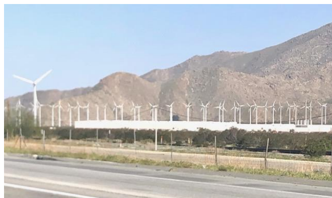
Wind generator farm in the Coachella Valley

"Yesterday's home runs don't win today's games." — Babe Ruth