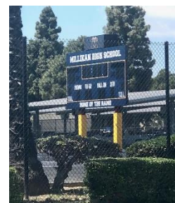
Millikan High School in Long Beach , California