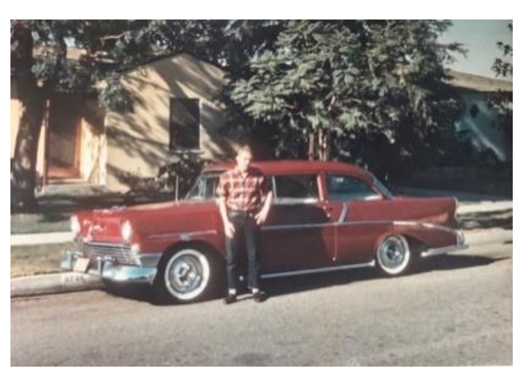
1956 Chevy parked in Long Beach in the 1960s.