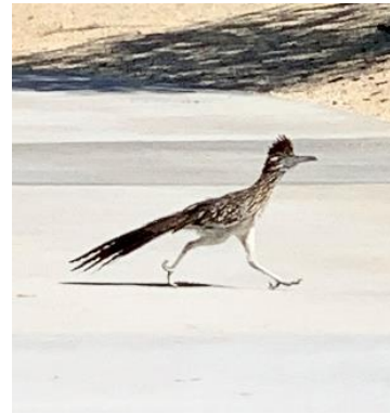
A real live Roadrunner in Rancho Mirage.