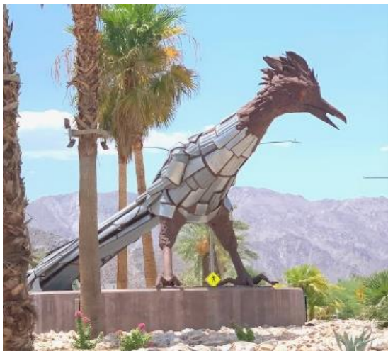
La Quinta Round-About Roadrunner!