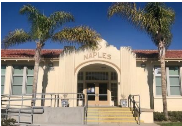
Naples Elementary School in Long Beach .