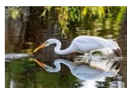
An egret fishes the shallows.