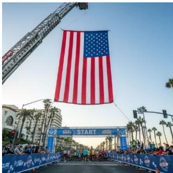
Surf City USA Marathon – February 6, 2022. Pacific Coast Highway never looked so good!