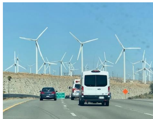
A scenic view in the Coachella Valley