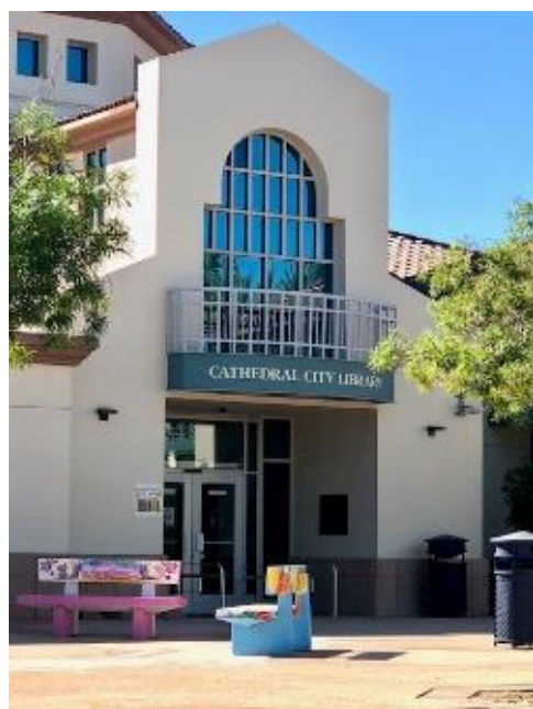
Cathedral City Public Library

Office: 120 South State College Boulevard, Suite 200 Brea, California