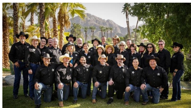
CJPIA Staff Team...800-229-2343