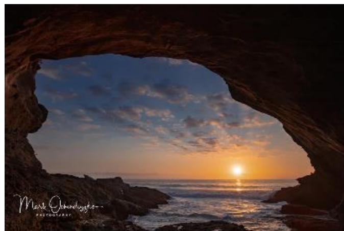
This is Thousand Steps Sea Cave in Laguna Beach. The cave is a large L-shaped structure and is best accessed during a very low tide. The photo was taken on Tuesday, February 1, 2022.