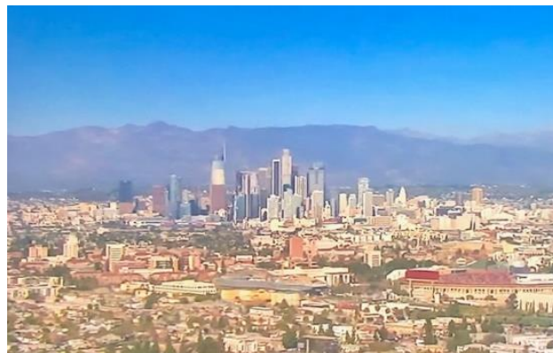
Los Angeles, California