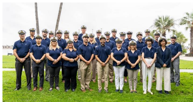
CJPIA Staff Team...800-229-2343