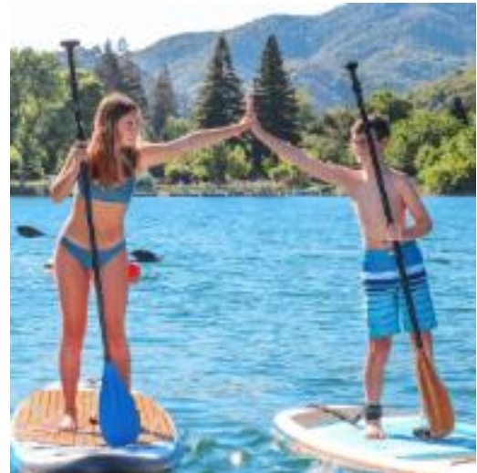
Lake County has been advertising the summer vacation opportunities they offer.