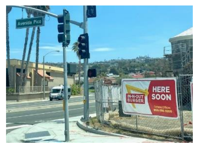
In-N-Out Burger to open in San Clemente

120 South State College Boulevard, Suite 200 Brea, California Telephone 888-861-0220