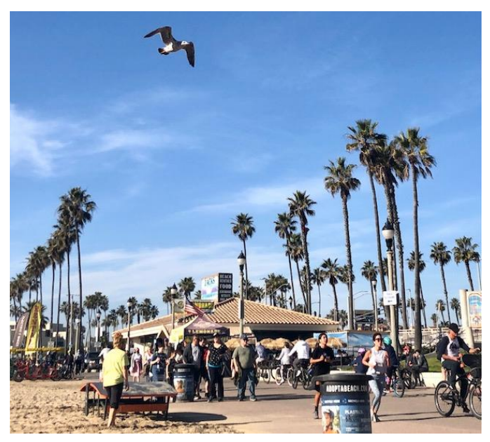
A sea gull watches a busy post pandemic <u>Huntington Beach</u> summer 2022