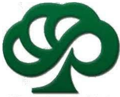
CITY OF PLEASANT HILL