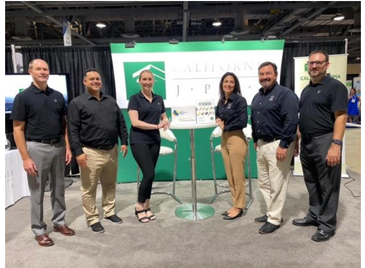
The CJPIA staff team attending the Annual League of California Cities Conference & Expo

Wolf & Company Inc. 560 East Commercial Street, Suite 16 Pomona, California 91767 Telephone: 909-345-849