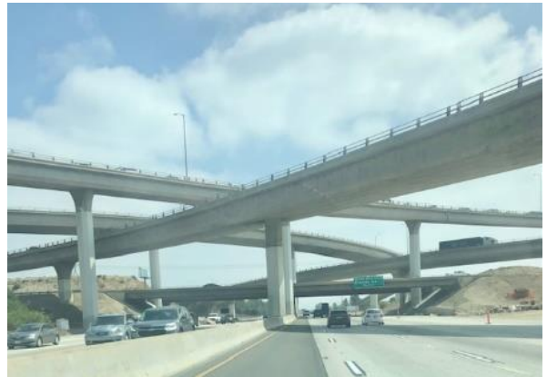
Freeway improvements are a full-time job.