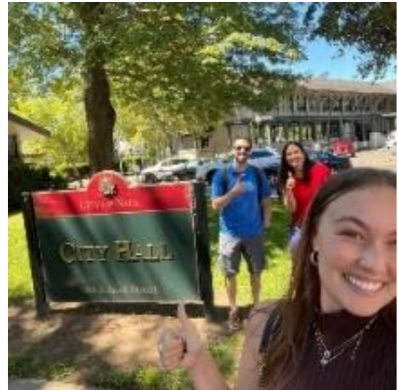
Team Tripepi Smith out meeting with City officials.