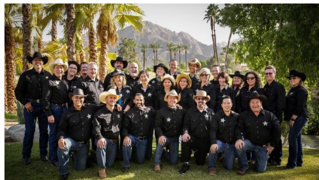
CJPIA Staff Team...800-229-2343