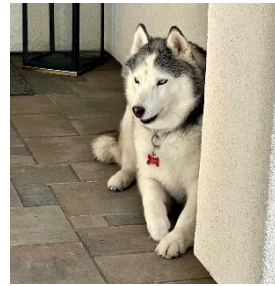
Lilo, the Wonder Dog, at home in Rancho Mirage .