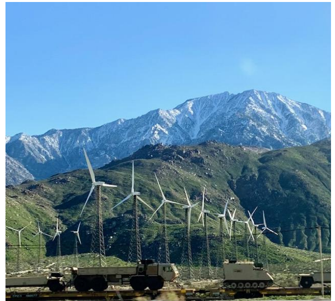
Military equipment travels the Coachella Valley on train flat cars with a wind farm in the background.

SAFE Credit Union Convention Center, Sacramento