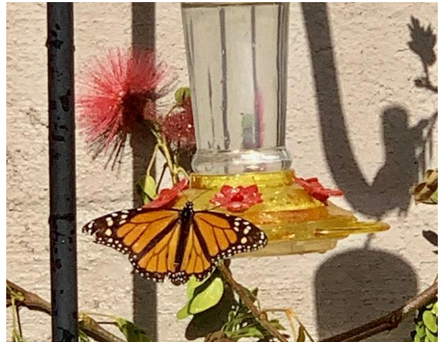
A Monarch in the Coachella Valley