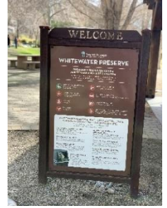
Whitewater Preserve in the Coachella Valley.