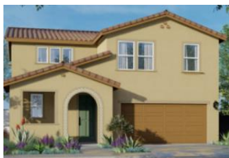
Blossom Walk, Compton

The Olson Company is a premier California builder of affordable new home communities in the state's most in-demand urban centers. In partnership with cities and other local and state agencies, Olson works to provide multi-tiered solutions to the critical issues of affordable for-sale housing, community redevelopment, transportation and sustainability. Recognized for creating thoughtfully designed communities within reach of California homebuyers, Olson has built more than 11,000 single-family attached, single-family detached, live/work and mixed-use in-town homes across 100 cities since 1988. Headquartered in Seal Beach, California, Olson is the proud recipient of many top customer experience awards including the 2012, 2016, 2017, 2018, 2020, 2021 and 2022 Eliaant Homebuyers' Choice first place awards for Overall Purchase and Ownership Experience.