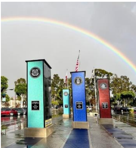
City of Norwalk Veterans' Memorial