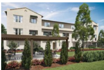
Jasmine Walk, Buena Park