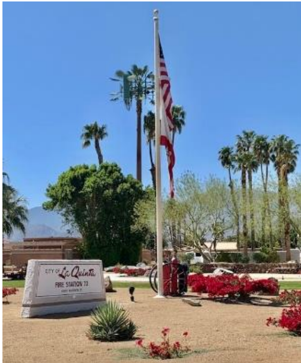
This picture of a City of La Quinta Fire Station was taken by Trackdown's Susan Simpson .