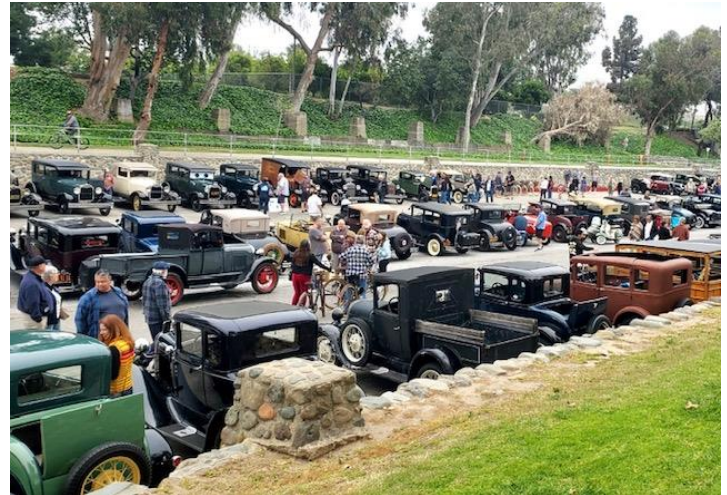
Classic Car Show at Hart Park in Orange .