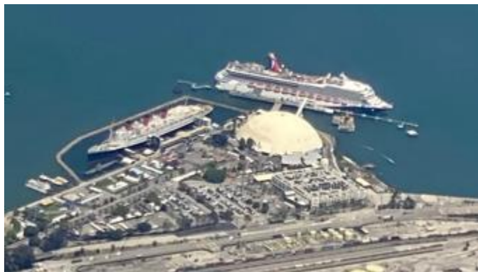
Compare the historic Queen Mary with a modern cruise ship at a dock in Long Beach.