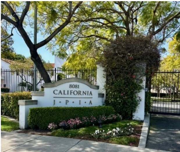
California JPIA home office in La Palma .