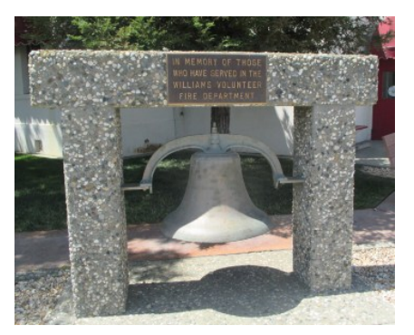
Dedicated in the City of Willows