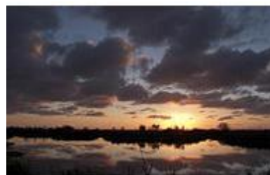
Dan Hauser Marsh in Arcata.