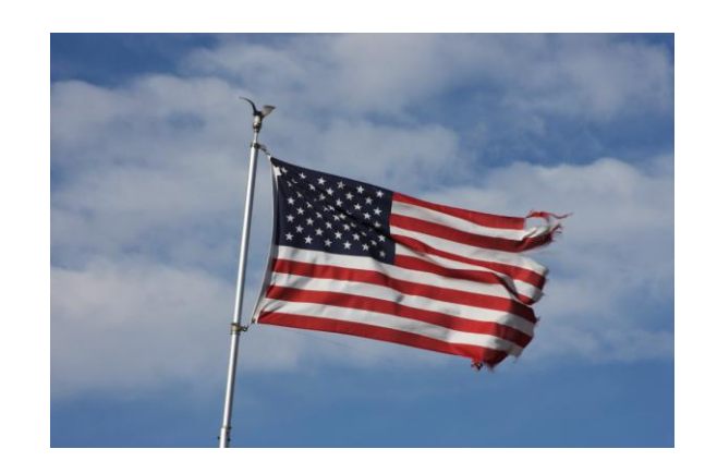
God Bless America: Thanksgiving wind in Broken Arrow, Oklahoma requires a new flag ASAP. Season's Greetings and Happy Holidays to all the readers of the City Manager Newsletter by Trackdown. Happy New Year 2011.