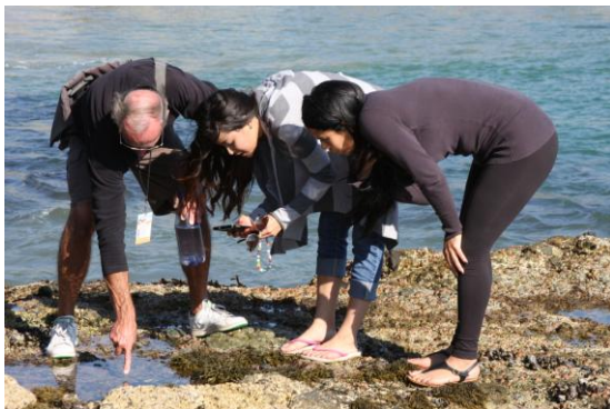
Volunteer helps explore the Laguna Beach tide pools.