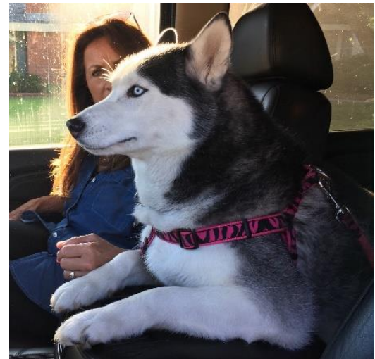
Trackdown's Lilo the Siberian Husky