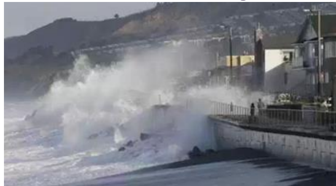
Beach Boulevard surf in Pacifica on January 23, 2016.

Earlier in the summer a special presentation was given at the Pacifica Coastsides Museum regarding the Sea Level Rise. Modern science and technology measurements allow the calculation of possible sea level rise. During the last 18,000 years the sea level rose 325 feet and the shore retreated about 25 miles from the Farallones to where today there is a beach. Another 150 feet of sea rise is possible should the remaining ice sheets melt. According to the 2017 study "Rising Seas in California," "Waiting for the scientific certainty is neither a safe nor prudent option."