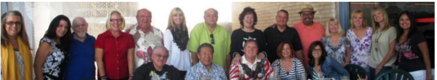
Posted in the November, 2013 issue: taken at 20-year Reunion of Bellflower