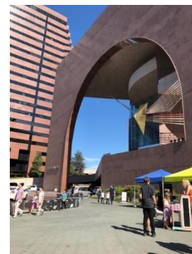
Segerstrom Center, Costa Mesa