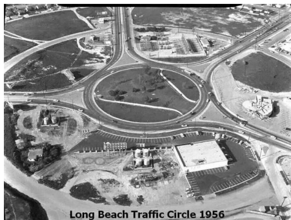
Round-abouts are not all that new.