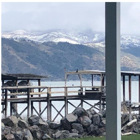
Snow on the hills around Clear Lake in Lake County in Northern California.

Members actively participate in shaping the organization to provide important coverage for their operations. The California JPIA provides innovative risk management solutions through a comprehensive portfolio of programs and services, including liability, workers' compensation, pollution, property, earthquake coverage, and extensive risk management training and loss control services.