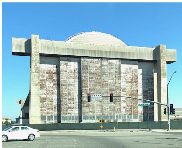
Established in 1942 as a Naval Lighter-Than-Air Station. This picture of Marine Corps Air Station Tustin was taken on Thursday, June 11, 2020.