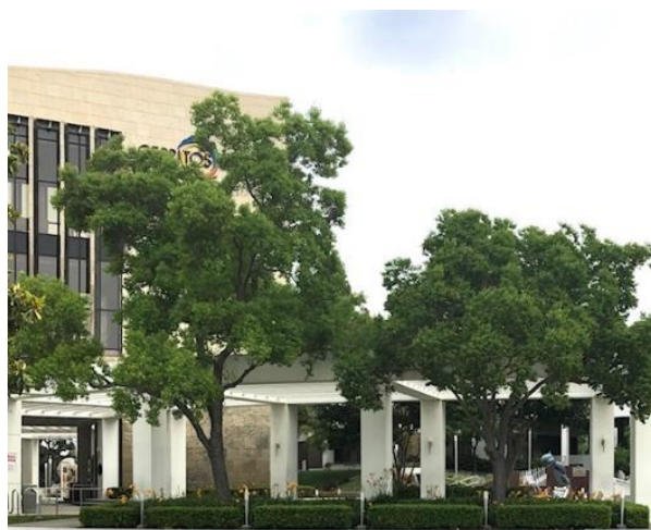
Cerritos City Hall and Library, June, 2020

Call telephone No. 530-432-7357 or 213-542-5700