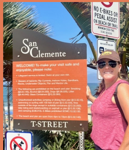
One of Southern California's premier family beaches with a nice outside break.