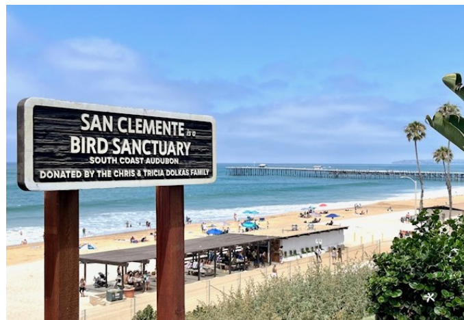
A view of the San Clemente Pier from T-Street.