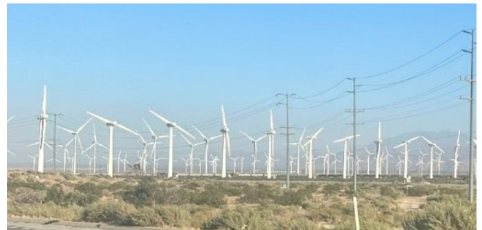
Wind farms are growing to help provide increased electrical power for public consumption.