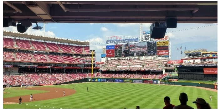
Juan Soto signed the biggest contract in Major League Baseball history when he signed a 15-year contract worth $765 million with the New York Mets.